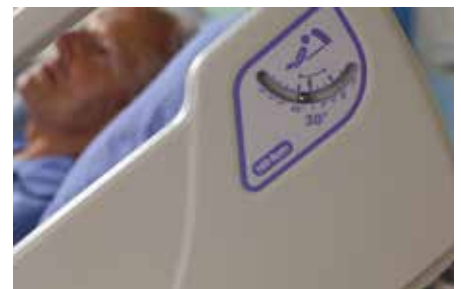
Easy-to-read Head-of-Bed angle indicator