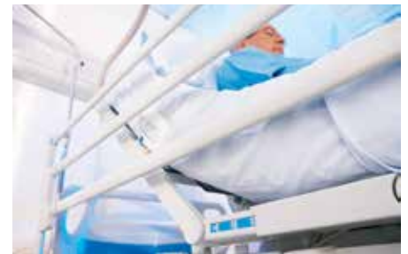
Line-Of-Site indicator ensures easy patient positioning