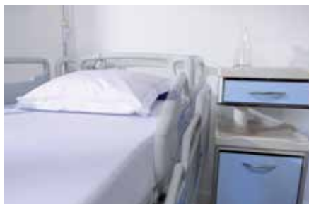
Siderails take up only 4 cm of bedside space