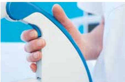
Double-lock out enhances safety