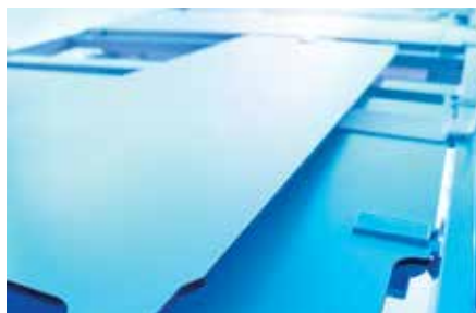
Easy to clean surfaces offer improved hygiene