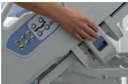
One step siderail release