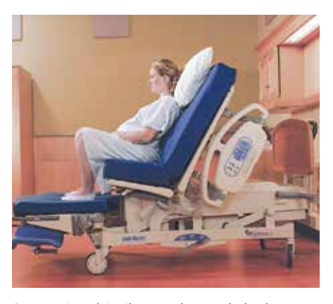
Automatic pelvic tilt to 15 degrees helps keep the patient in place during labour and improves positioning during birth.