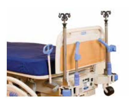
Ergonomic push handles and integrated permanent IV poles.

The Affinity 4 birthing bed delivers on the promise of a safe birthing bed that functions in the busiest environment with ease. No more hassle with a removable foot section. With the Affinity 4 Stow and Go™ feature, the integrated foot section simply slides under the bed for birth and back into place afterward. Or, if you choose our ergonomically designed lift-off version, simply place the foot section on the built-in stand.